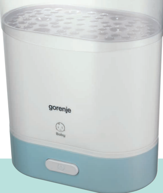
STEAM STERILIZER ST 550BY