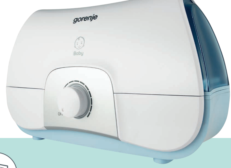
ULTRASONIC HUMIDIFIER H 17BY